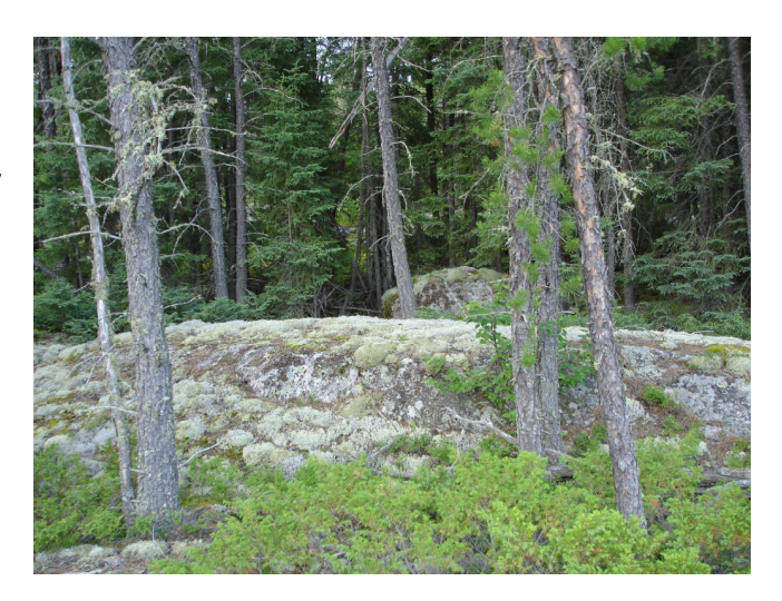
Figure 3.2: Locations of potential campsites on Dinosaur Rock and Lake F

Next to portage (into Lake D) at North end of Lake C. Elevated rock tables. Okay landing. Two potential tent sites.