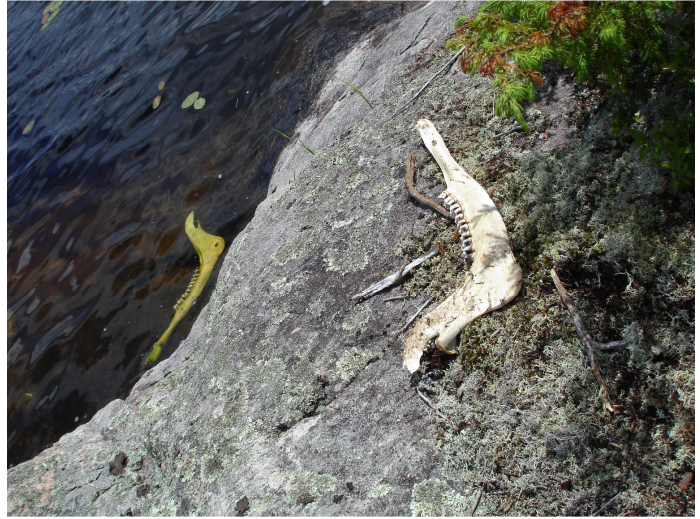
Set of moose jaw bones, Streak Lake