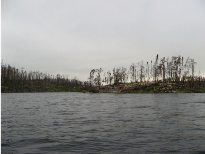
A grey and wet day in burned country