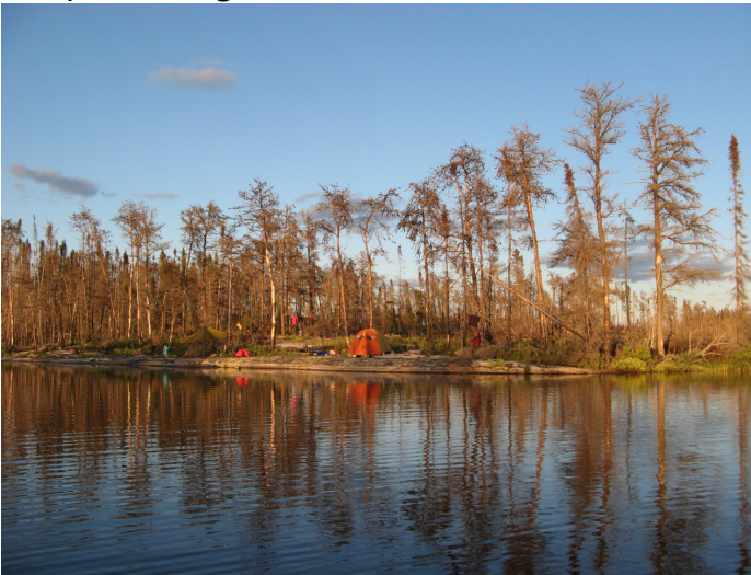
Campsite on Jigsaw Lake