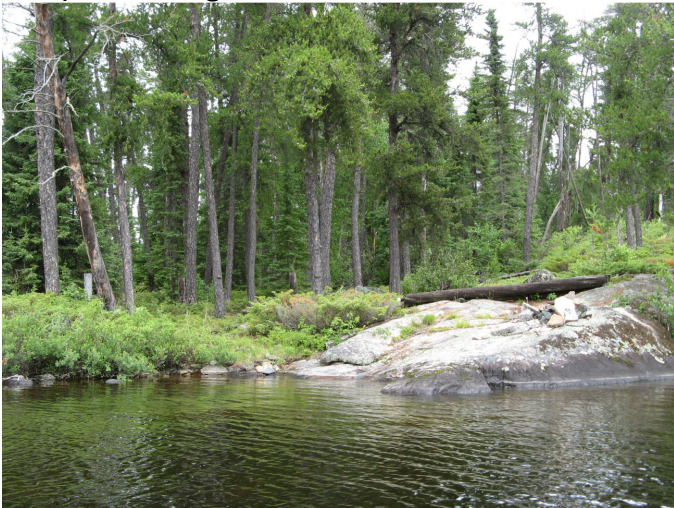
Campsite at Aegean Lake