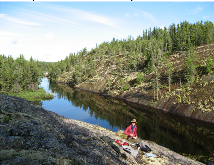
Lunch spot near entrance to Crystal Lake