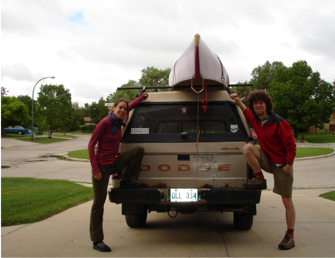
Departing Winnipeg, Manitoba