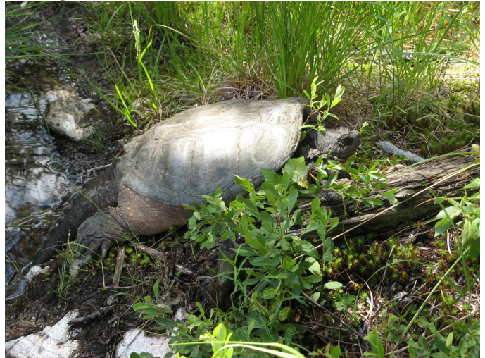
Giant Snapping Turtle at the beginning of the portage into Wrist Lake