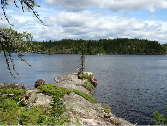
Lunch spot on point near portage into Wrist