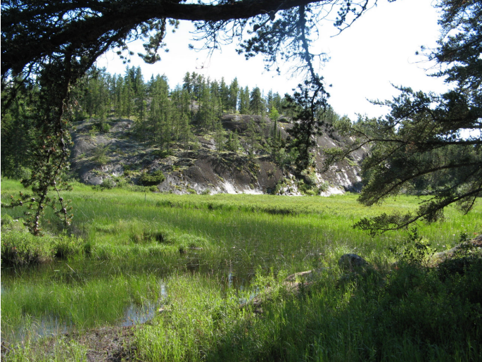
Cliff walls along the Wanipigow River