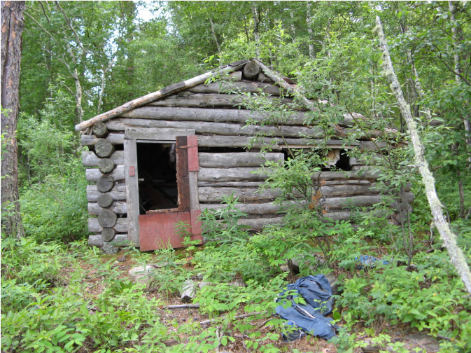
Old trap cabin, South shore of Haggart Lake