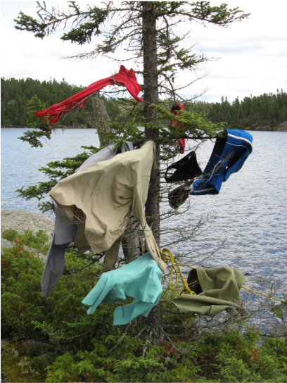
Our improvised Christmas tree