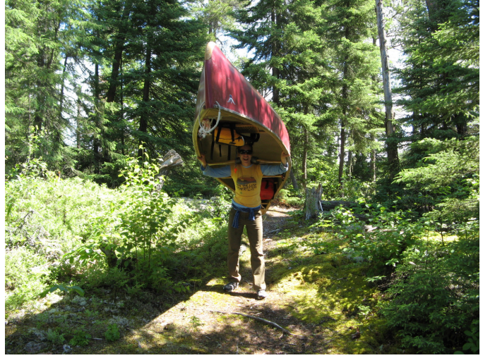
Jacynthe's first portage!