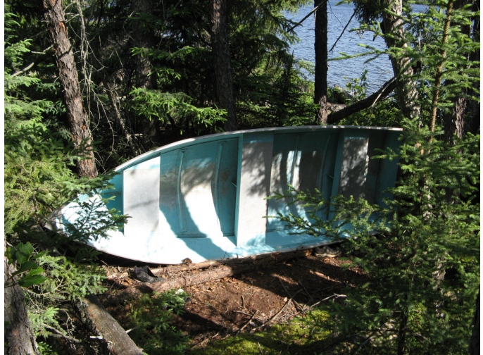
Boat cached near campsite on Adventure Lake