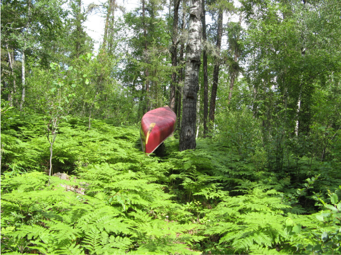
Fern forest along portage to Haggart Lake