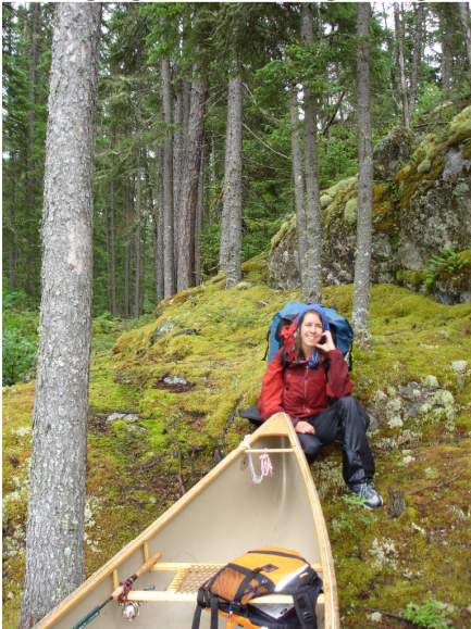
Portaging with soaking wet gear