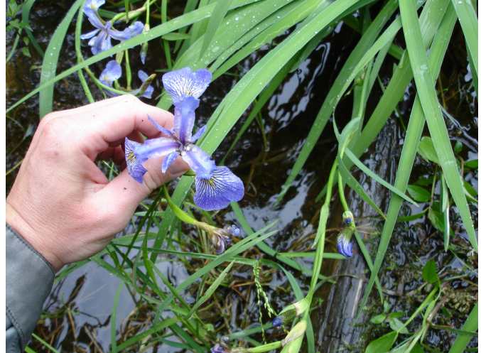
“Blue Flag” Irises along portage