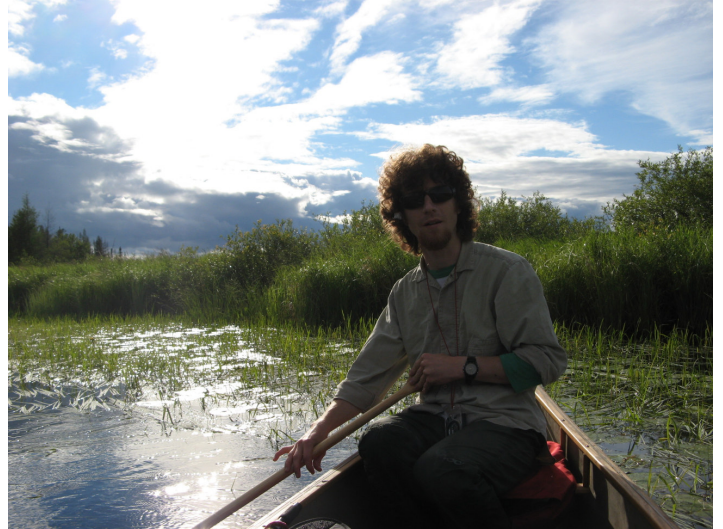
Ever-changing skies on the Wanipigow River