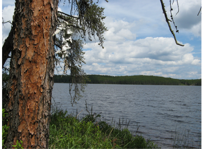
Entrance to Haggart Lake