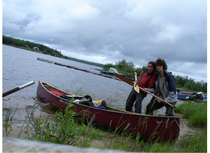
Launching the boat at Wallace Lake under grey skies