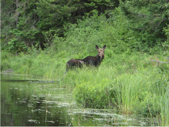
Moose near Ontario border