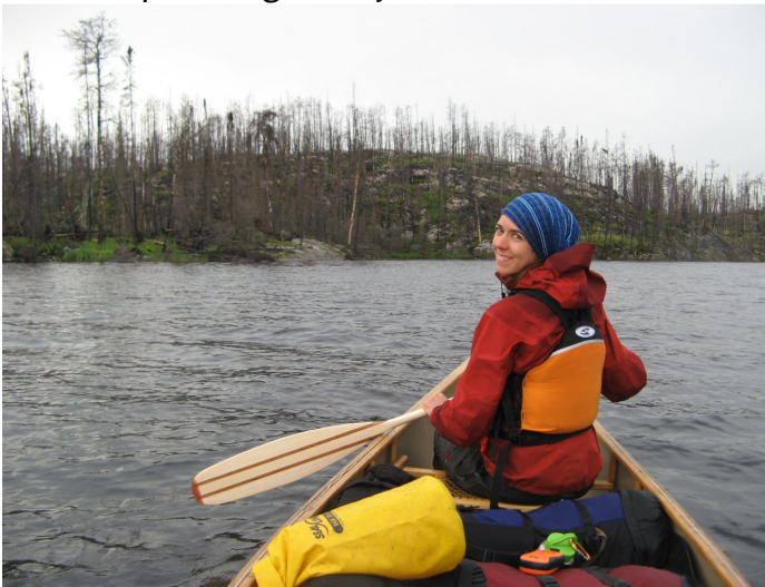
Must keep moving to stay warm!