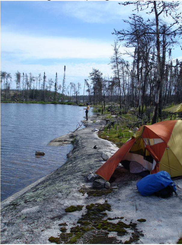
Great fishing off rocky ledge