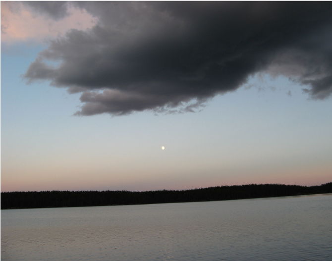
Moon rise on Adventure Lake