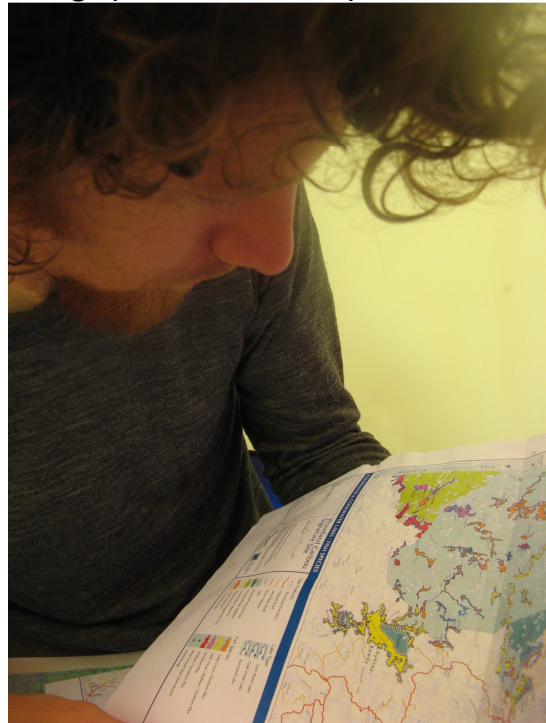
Sizing up alternate route possibilities