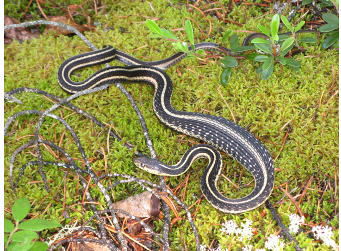
Recently-fed Garter Snake