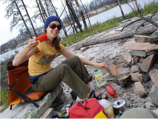
Cheers to instant espresso!