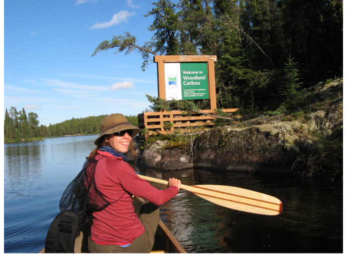
Entering Woodland Caribou Park