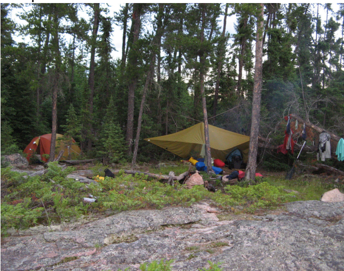
Campsite on Adventure Lake