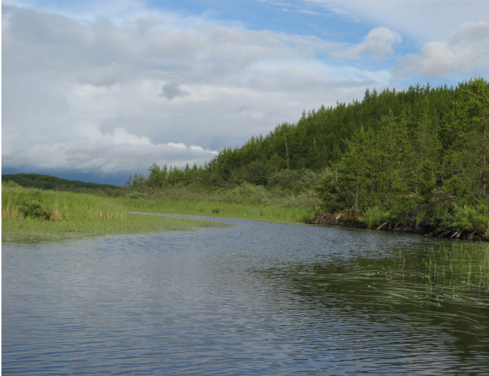
Paddling up the Wanipigow River