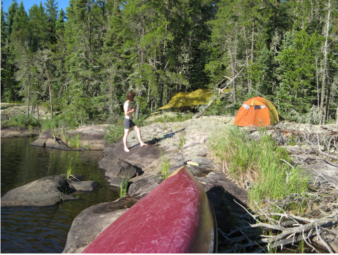
Sunny morning at campsite on S. E. Crystal