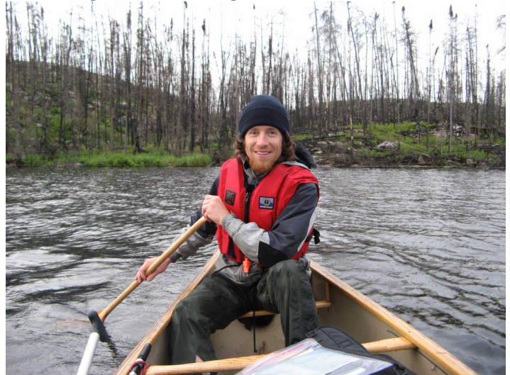
Searching for the portage into S. Welkin