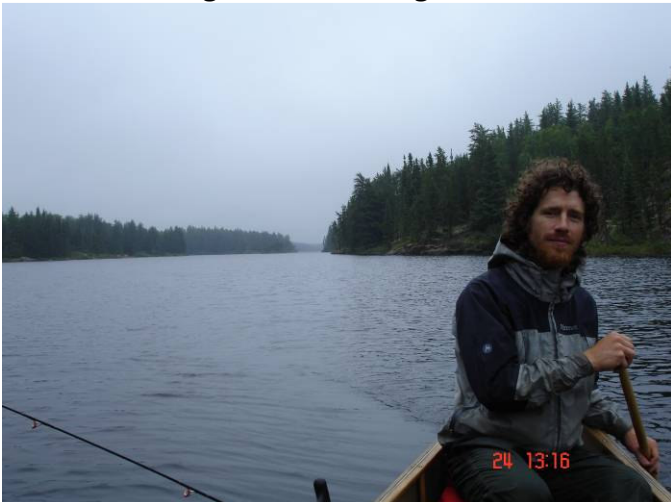
View of Walking "Stick" looking north