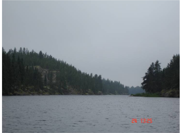
View south from below bottleneck