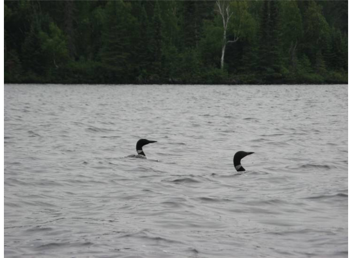
Our swimming partners, a pair of doting loons