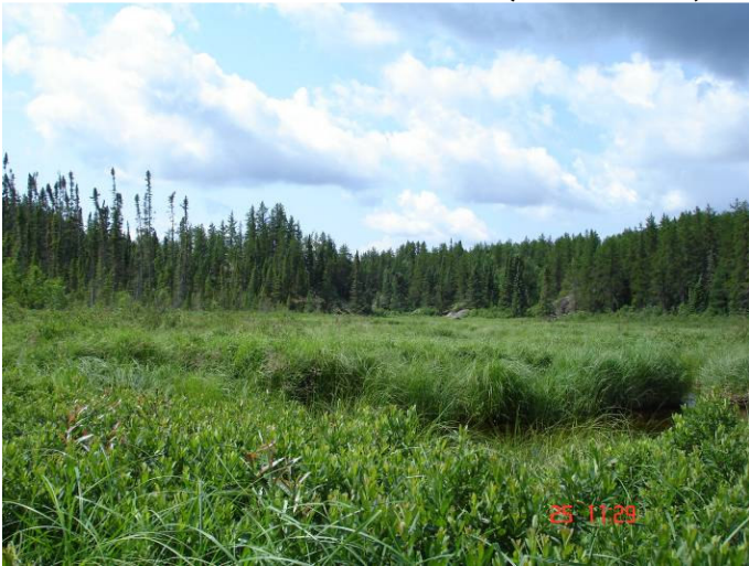
View south towards 2 nd landmark (constriction)