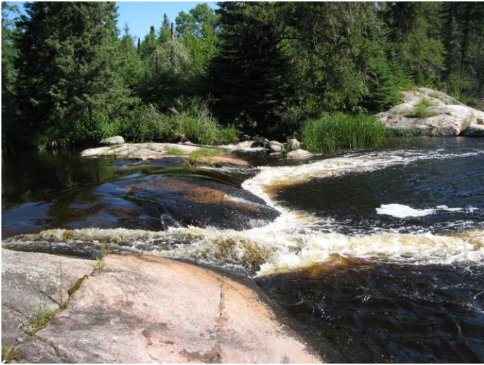
Rapids at the border of the two parks