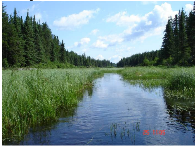
Looking north towards mouth of river