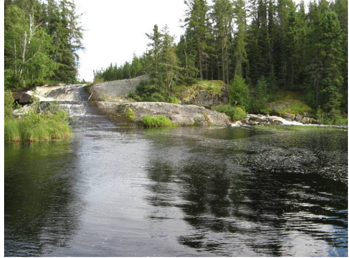
2 nd Set of Rapids, North Carroll Lake (View from Bottom)