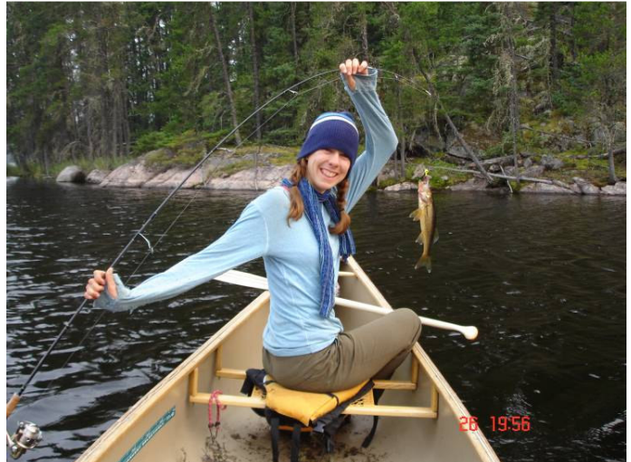
Catch-and-release in the little walleye hole