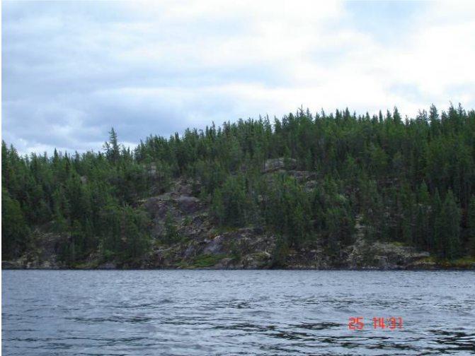
Cliffs, North Carroll Lake