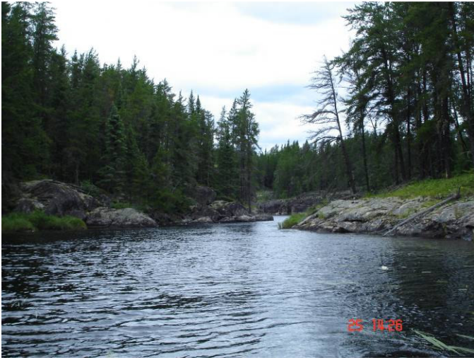
Narrows along North Carroll Lake