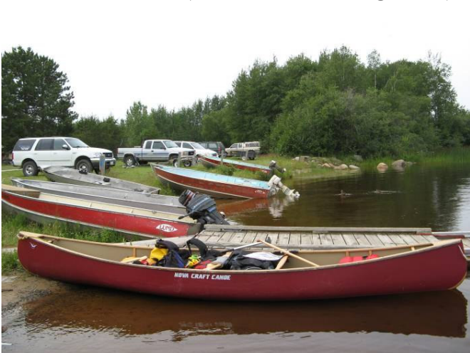
Back to civilization (Wallace Lake campground)