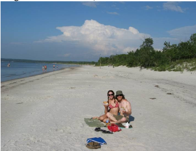
Burgers on Grand Beach, Manitoba