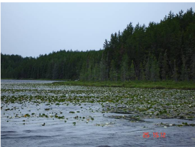
Water lilies, North Carroll Lake