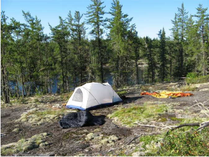
Alternative campsite on Dinosaur Rock Lake