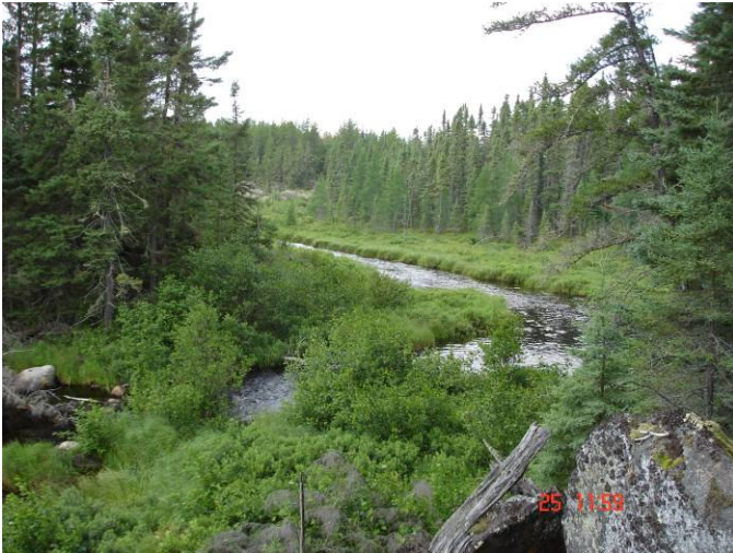
SW view of junction from bluff atop lake east of Walking Stick River