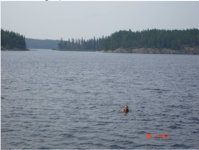
A refreshing dip in Carroll Lake