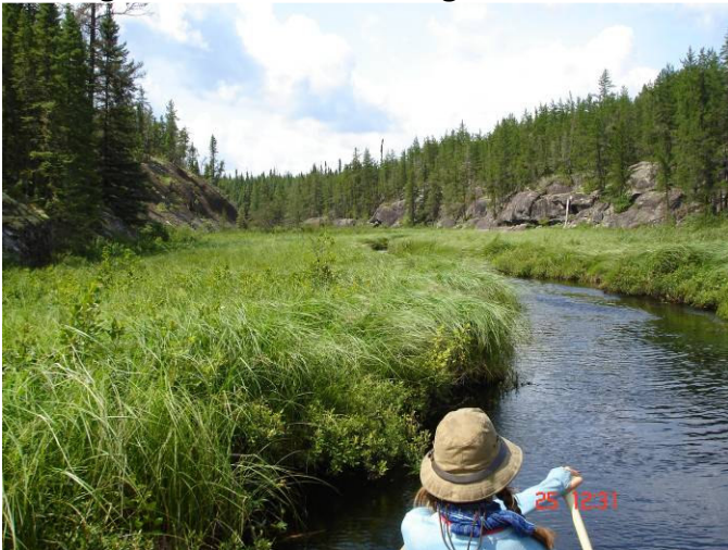
Nearing the end of the Walking Stick River