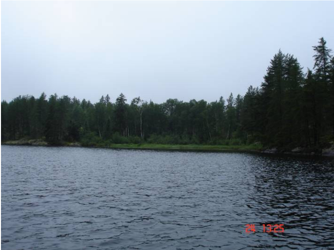
Bay to the west just south of 2 nd Narrows