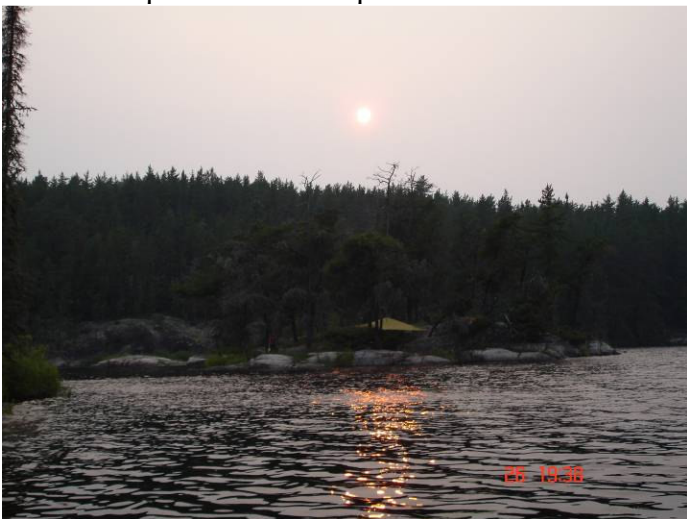
Island campsite near SW tip of Carroll Lake