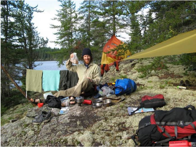
Breakfast along Gannon's Bluffs