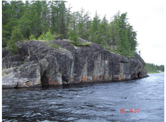
Cliffs along North Carroll Lake