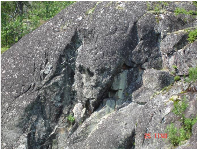
Skull face in rock!