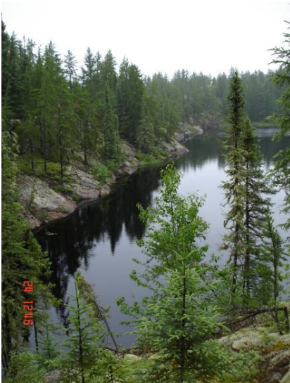
Small lake to the east of 1 st Narrows