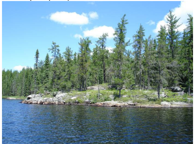
Lake F (Campsite)