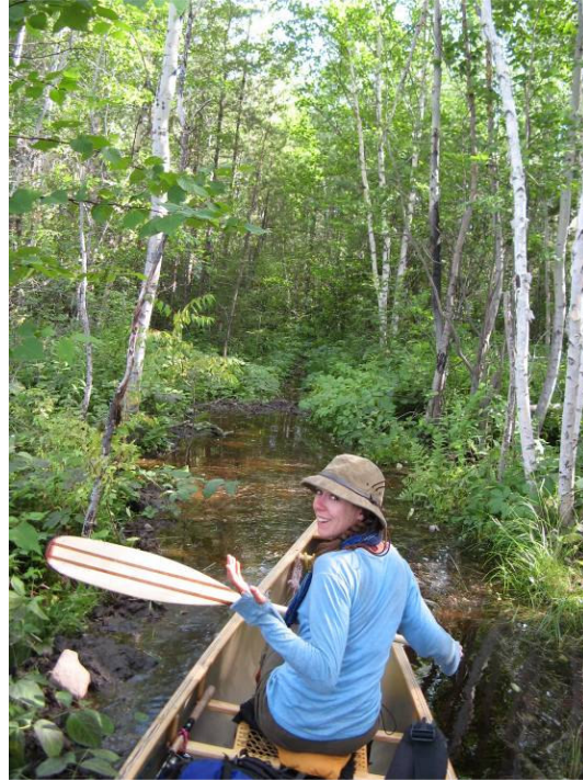
Submerged trail at beginning of 2.4 km portage from Kidney Lake to Siderock Lake