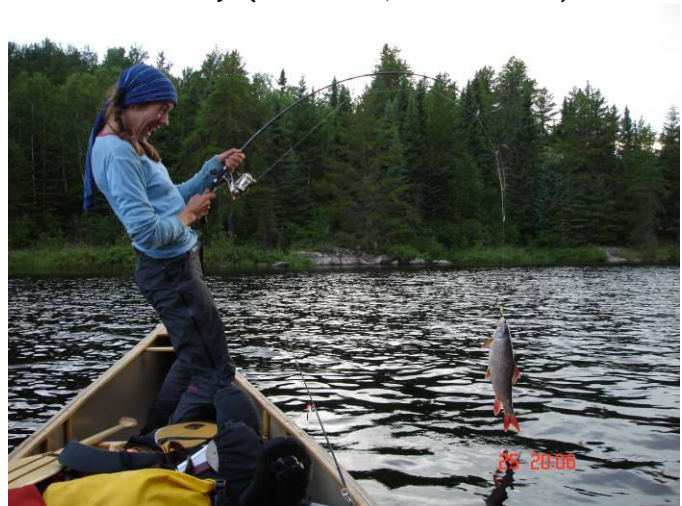
Catch of the Day! (Whitefish, Carroll Lake)