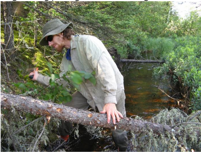
Negotiating passage on the Walking Stick River