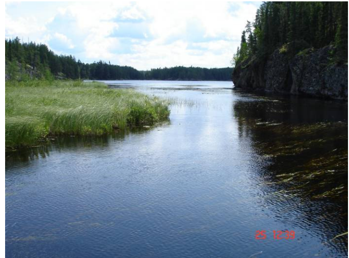
Entrance to North Carroll Lake at the end of WSR