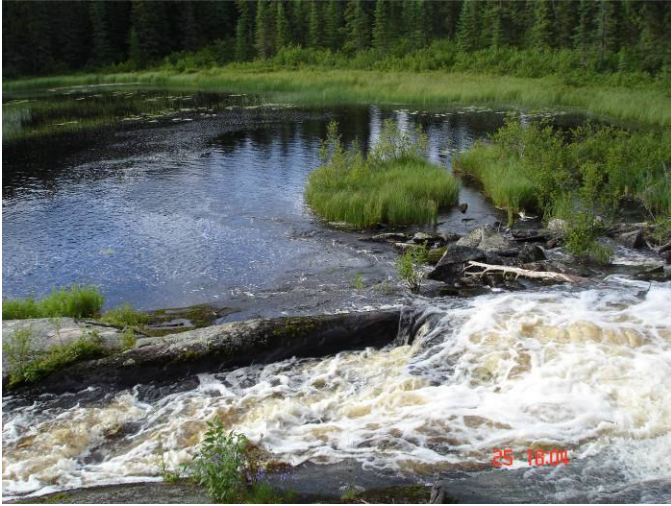
2 nd Set of Rapids, North Carroll Lake (View from Top)