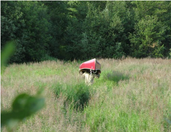
Portaging through prairies on 2.4 km portage between Kidney Lake and Siderock Lake