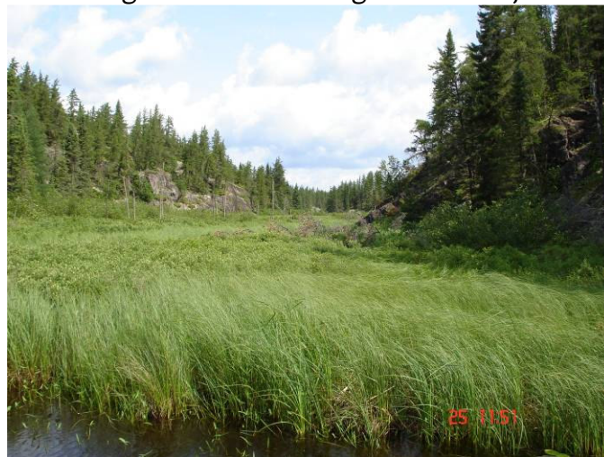
Walking Stick River looking north from junction