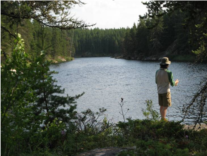
Determined to catch the Big One!