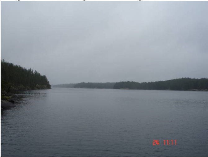
Long arm of Walking Stick looking south