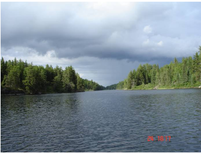
View north towards 2 nd Narrows from South Arm