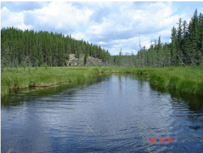
End of Walking Stick River (looking upstream)