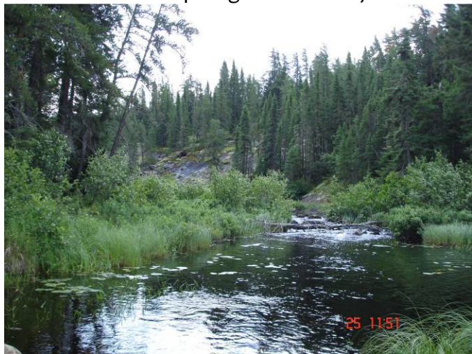
View of creek spilling into WSR at junction