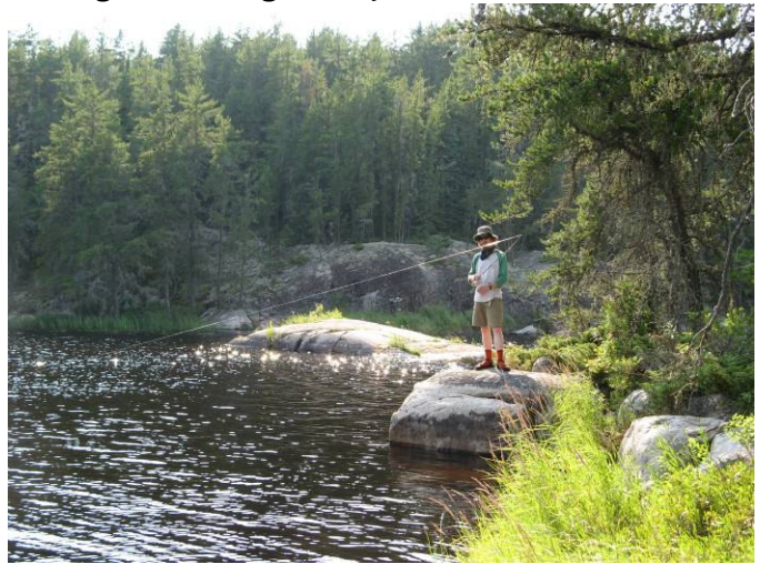
Fishing for the Big Walleye