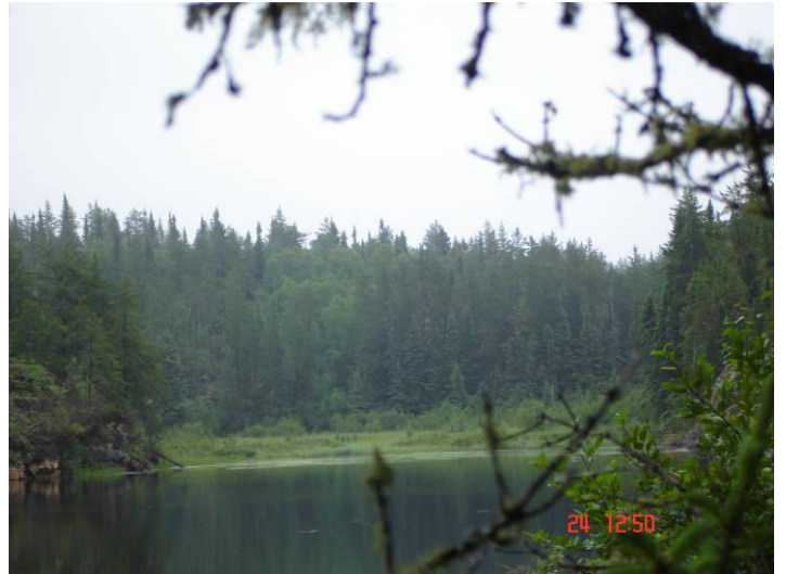
View of stream entering small lake east of 1 st Narrows