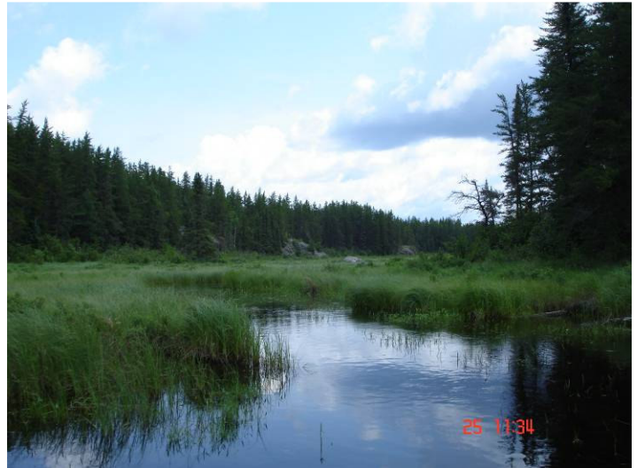
View north in direction of 2 nd landmark