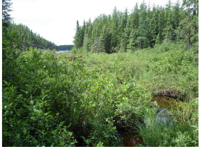
Creek linking Lake G to Walking Stick Lake