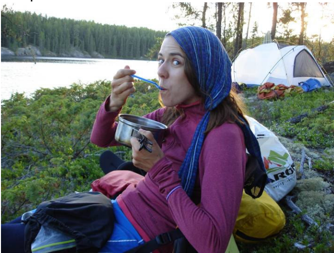
Campsite on Lake F