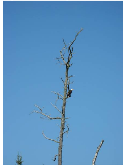
Bald Eagle welcoming us to Obukowin