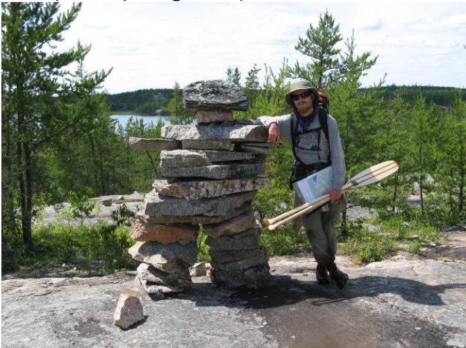
The famous "stone man" between Obukowin and Kidney Lake (background)