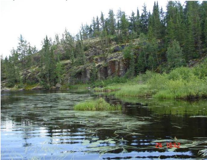
Playland of rocky bluffs