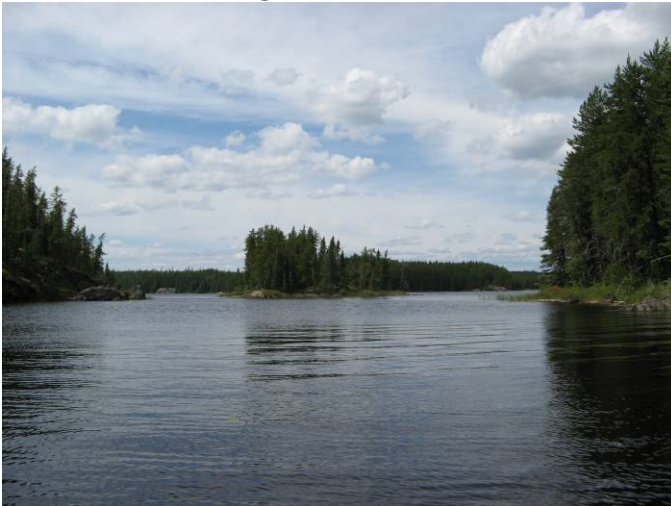
Entrance of Walking Stick Lake