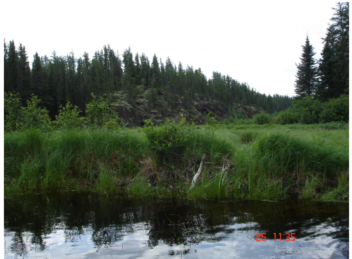
Beaver dam with more bluffs ahead