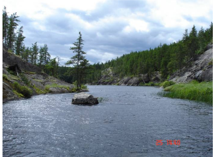
Windy swifts, North Carroll Lake