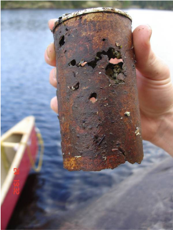
Old Cola can found in Walking Stick Lake