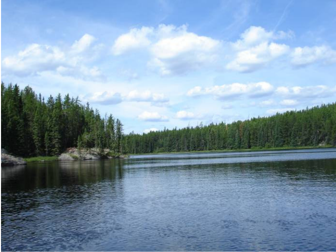
Lake G leading into Walking Stick Lake