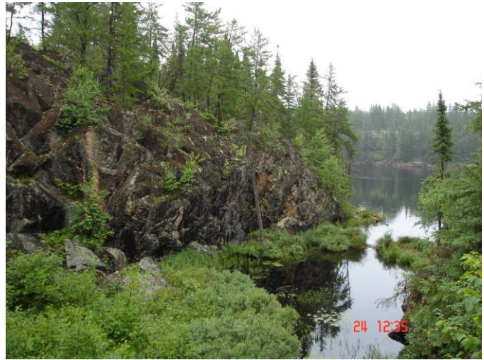
View of small lake to the east of 1 st Narrows