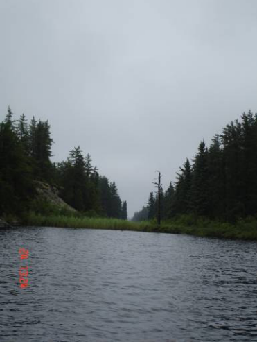
Bottleneck leading into 2 nd Narrows