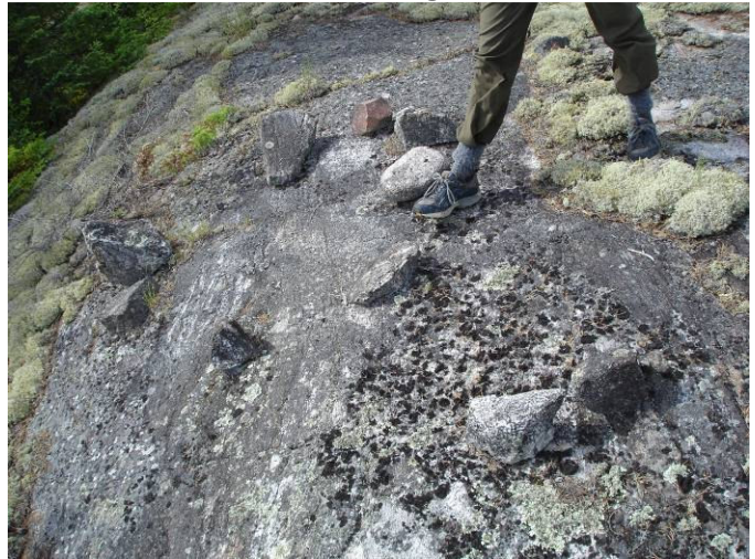
Potential petroform, Walking Stick Lake