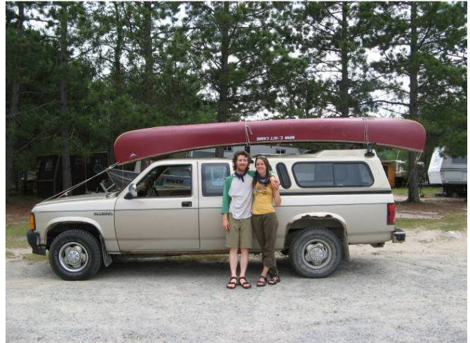
Time to head home for Winnipeg