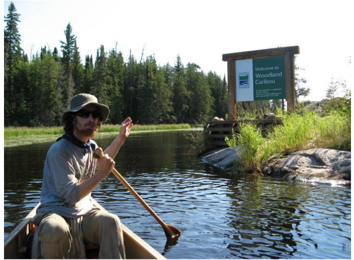
Leaving Woodland Caribou Park, Ontario