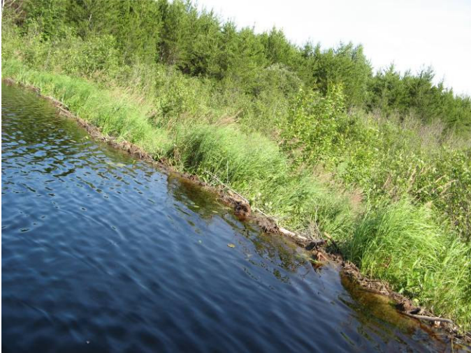
Giant beaver dam at beginning of 2.4 km portage from Kidney Lake to Siderock Lake