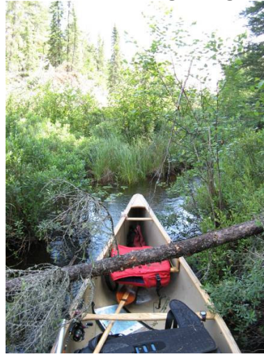
Obstacles near the beginning of Walking Stick River