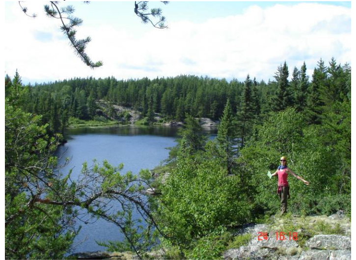
View atop "Gannon's Bluffs"