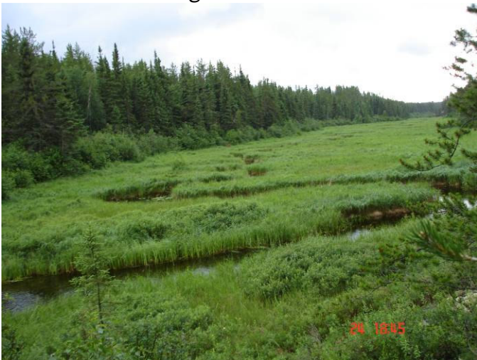
First view of Walking Stick River