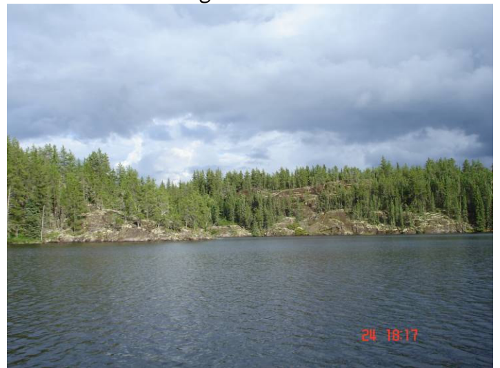
South Arm of Walking Stick