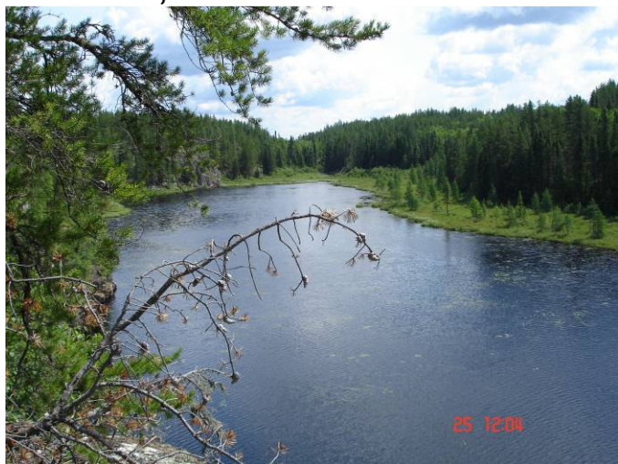
Lake east of junction in WSR