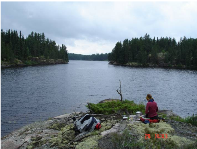
Point with view towards South Arm