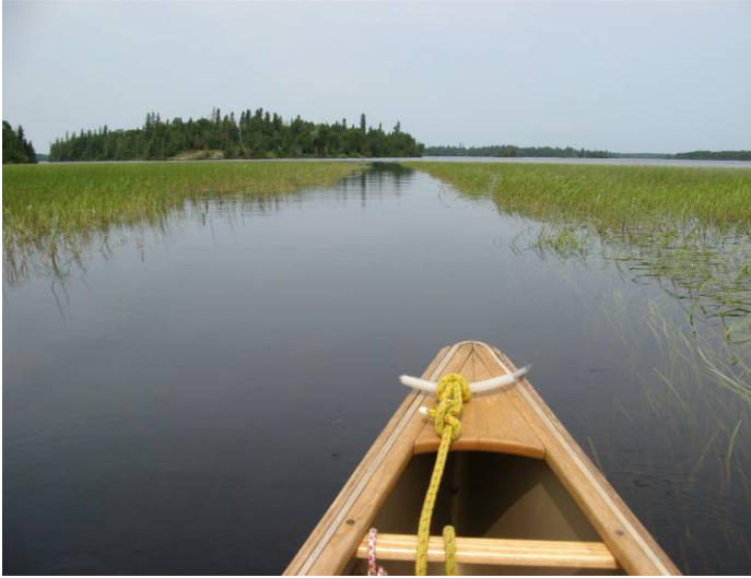
Entering Wallace Lake from the Wanipigow River