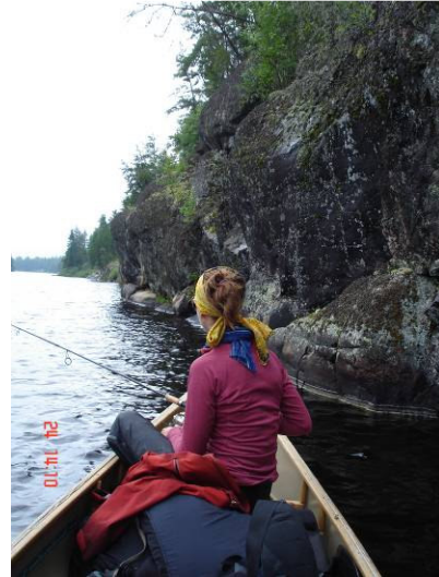
Fishing along 2 nd Narrows (lower arm of WSR)