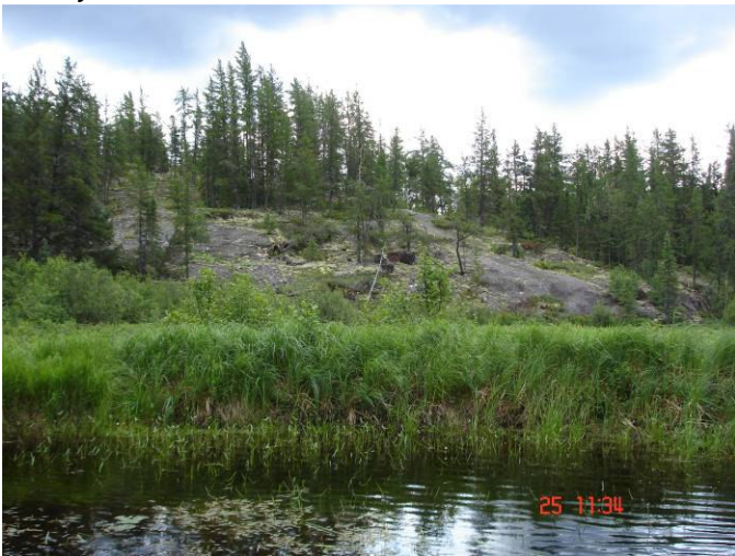
Rocky shoreline on west side of WSR