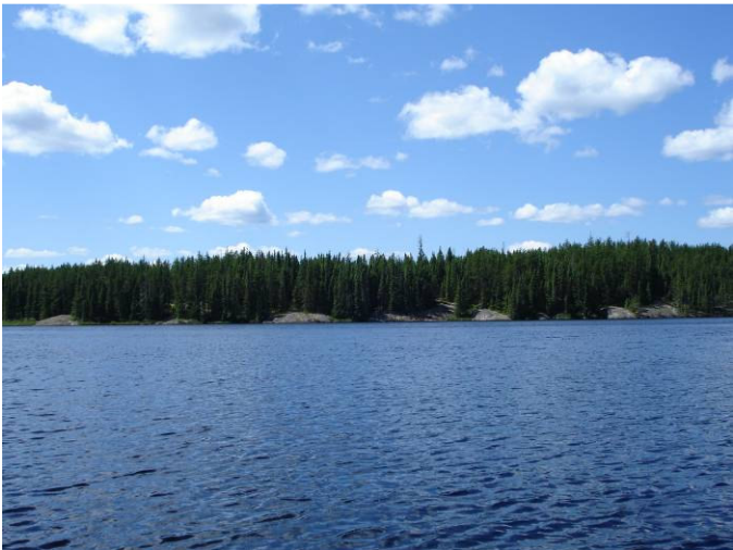
Dinosaur Rock Lake