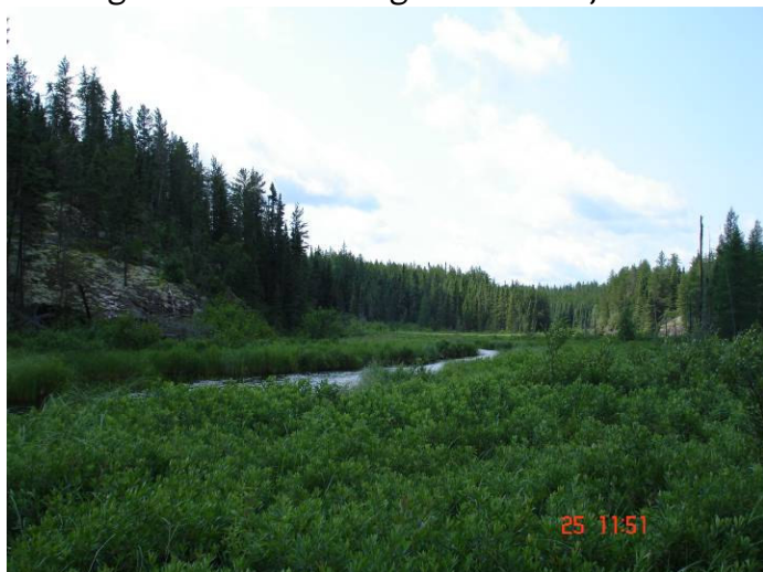
Walking Stick River looking south from junction