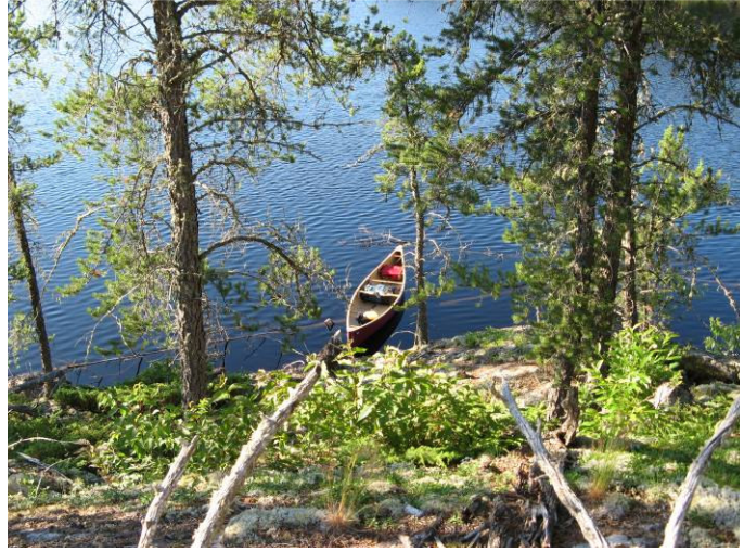
“Bear-proof” food-storage, Dinosaur Rock Lake