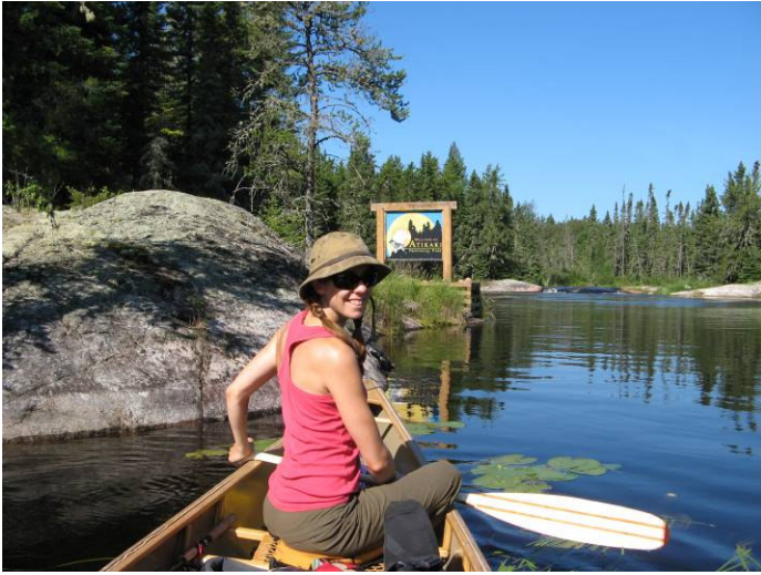
Entering Atikaki Park, Manitoba