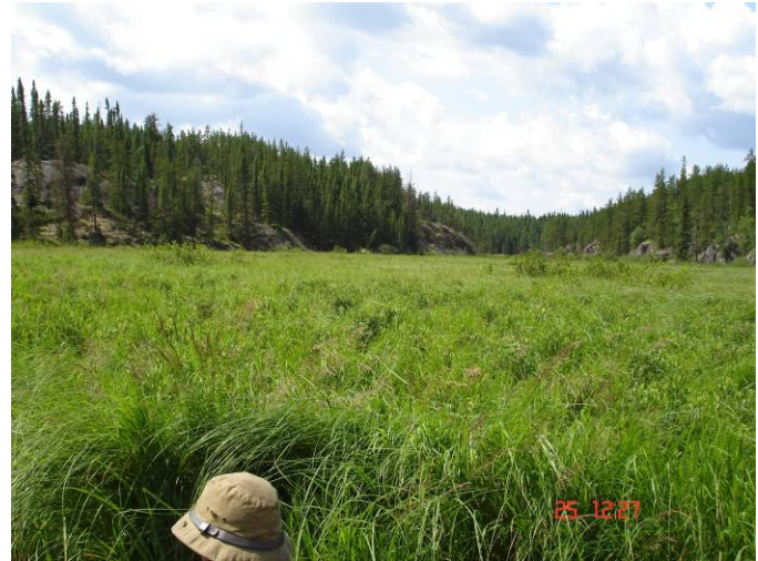
Expansive freshwater marsh along Walking Stick River south of junction