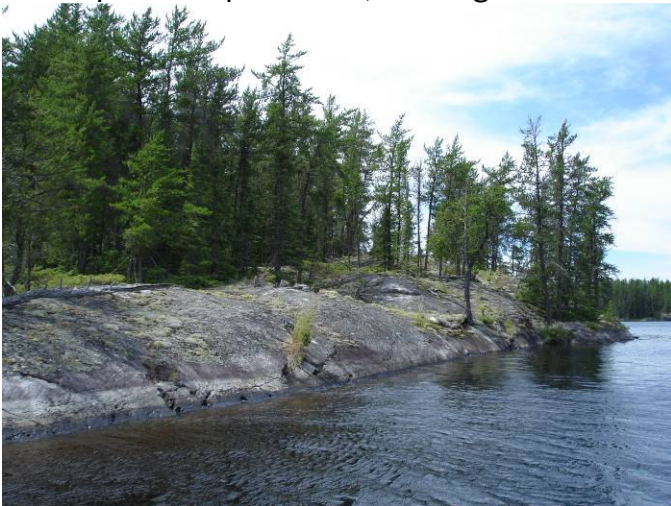
Site of potential petroform, Walking Stick Lake