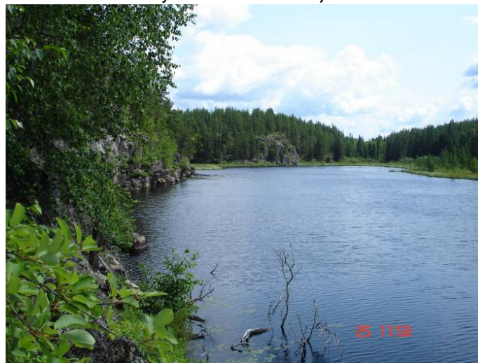
Lake immediately east of WSR at junction