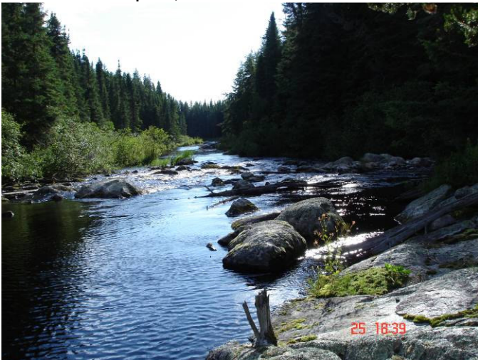
Third set of rapids, North Carroll Lake